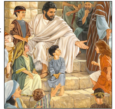
“Let the Children Come”

The target for completing the onsite preparations is around October. There will be opportunities for our members to help with various tasks once the work begins, to keep our costs at a minimum. Look for these opportunities and volunteer if you have skills in a certain area!