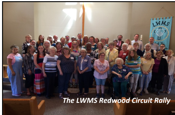
The LWMS Redwood Circuit Rally